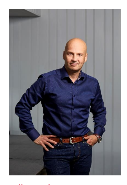
"We have adapted our work procedures and operations have been able to proceed in a good way."